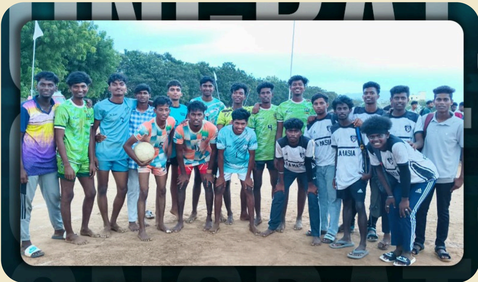
III Prize in Kabaddi CM Trophy