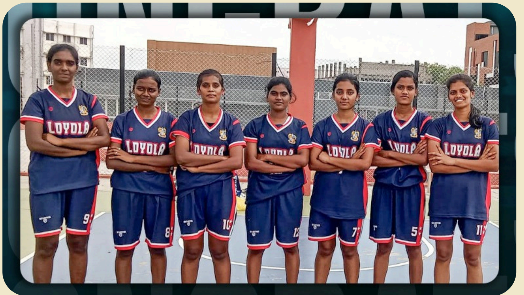
Runners Up in Basketball CM Trophy