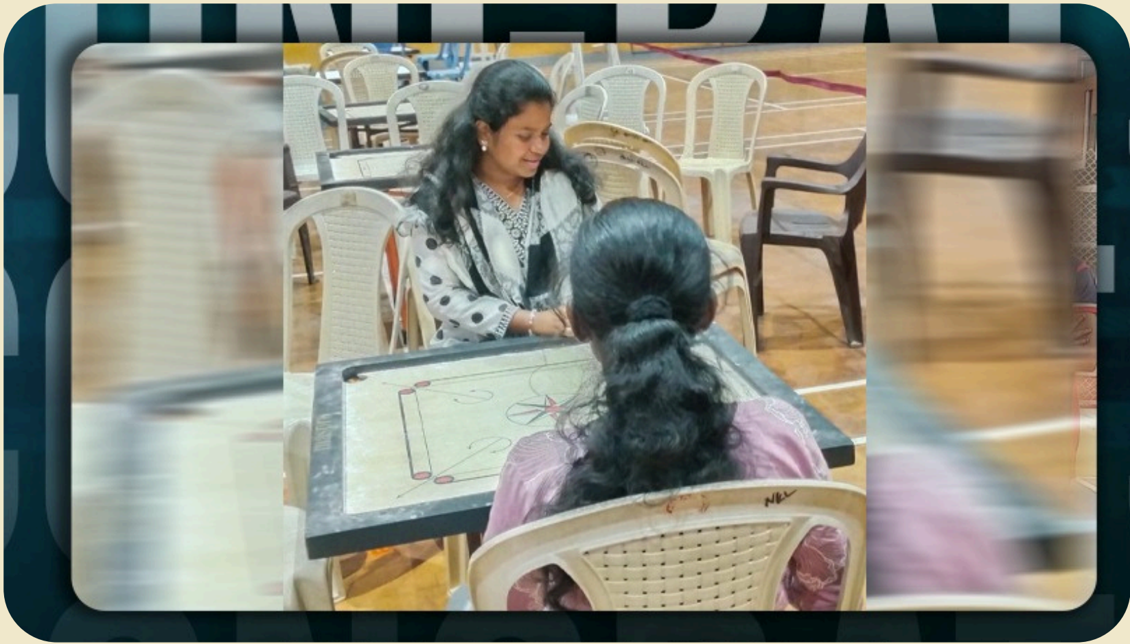
I Prize in Carrom CM Trophy