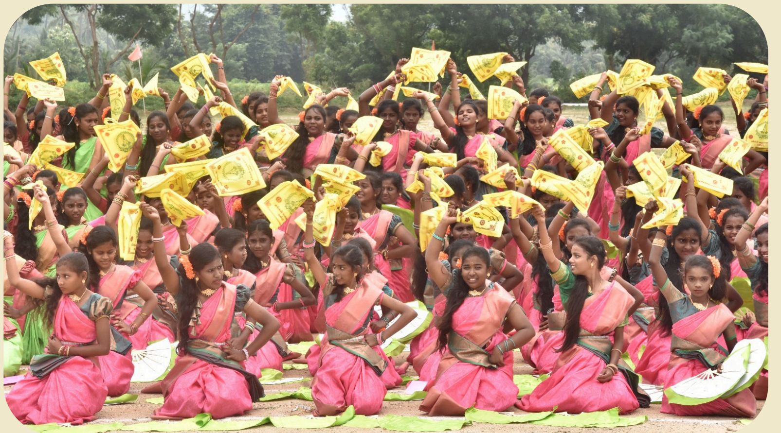
Guest Performance by St. Joseph's School, Sooramangalam